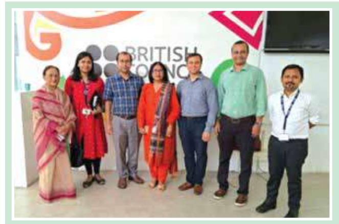
BELTA representatives with British Council officials on its premises

The meeting concluded with a positive outlook towards future collaborations. The two organisations look forward to the potential for joint efforts in research, teacher training, and resource development. This event is a step forward in BELTA's journey towards achieving excellence in English language teaching and learning, with the support and partnership of the British Council.