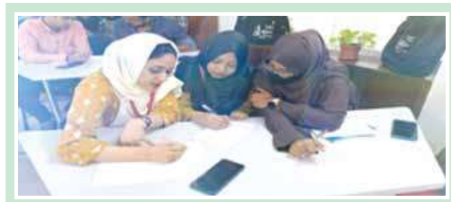
Participants doing an activity in the workshop

Bangladesh English Language Teachers Association (BELTA) collaboratively organized a transformative teachers' training workshop.