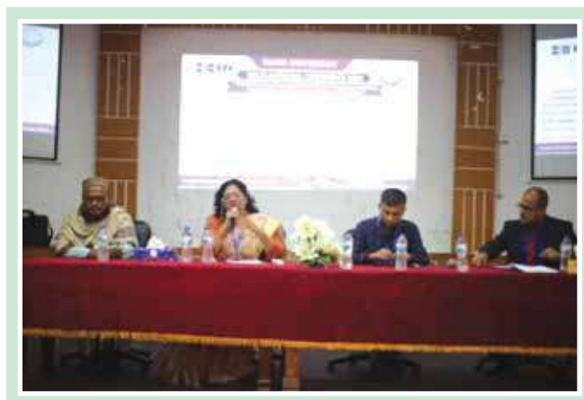
Panelists at the Panel Discussion