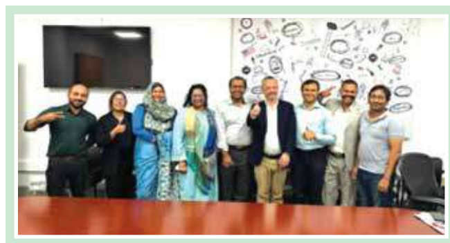
BELTA representatives with RELO and US Embassy, Dhaka Officials at American Center

This interaction between BELTA and the RELO not only marked a promising step towards mutual cooperation but also demonstrated the shared vision of both organisations in advancing English language education. The engagement serves as a testament to BELTA's proactive approach in seeking international collaborations to further its mission of improving English language education, showcasing its ongoing commitment to excellence and innovation in the field.