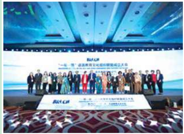
Delegates at the Inaugural Meeting of BRLCN