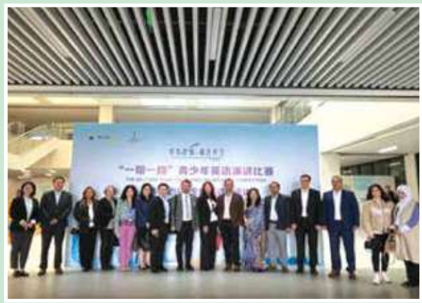
Delegates at the Speaking Competition