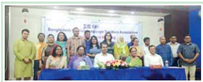
Elected EC members with the Advisor and Immediate Past President