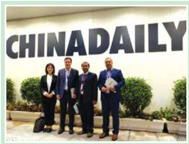
With members from China Daily and TELLSI