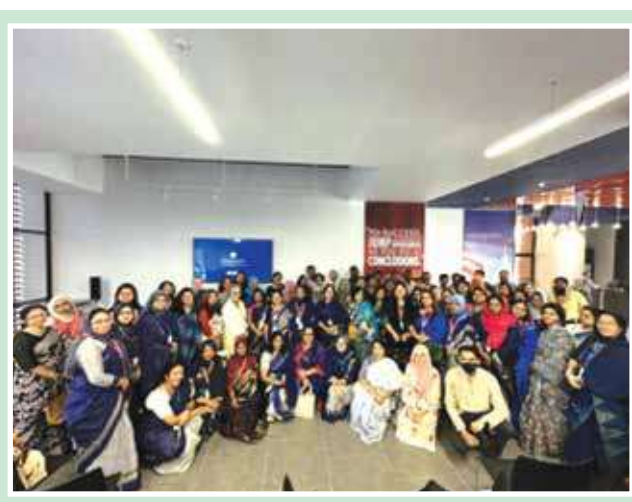
RELO's session in Rajshahi