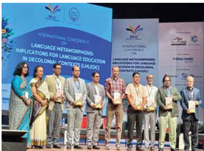
With the fellow discussants of the colloquium at the conference