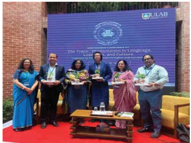
With the fellow panelists at the conference

Panel Discussant at the international conference titled “The Trans-Phenomenon in Language, Literature, and Culture,” organized by the University of Liberal Arts Bangladesh (ULAB) on 15-16 November 2024. The title of his panel discussion was “Glocalizing Professional Learning: Insights from the Margins.”