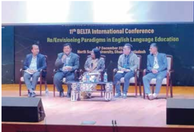
Speakers at the Panel Discussion