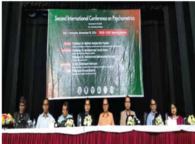
With the Chief Guest and other delegates on stage

Speaker at a colloquium at the international conference on “Metamorphosis of Language and Language Education: Social Justice and Equity”, organised by BRAC Institute of Languages, BRAC University, Bangladesh held on 28-30 November 2024. The title of the colloquium was “Transforming English Language Education in Bangladesh: Future Directions” and he spoke on the methodology of English Language Education and highlighted the need for rethinking and decolonializing English language teaching methodology in Bangladesh context.