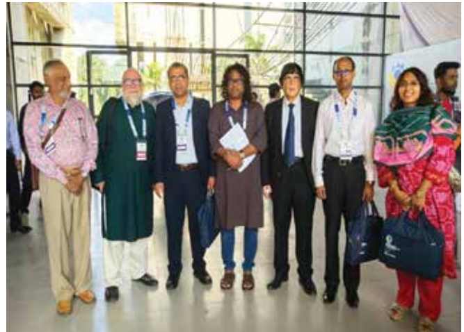
With the Keynote, Plenary speakers and other delegates at the conference

Panel Discussant and Plenary Session Chair at the 3rd international conference on Innovation and Transformation for Development with the theme, “The World at a Crossroads: Issues in Arts and Social Sciences”, organized by Green University of Bangladesh on 9-10 November 2024.