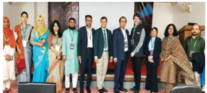
With the Chief Guest, Keynote Speaker and other delegates at the GASD conference