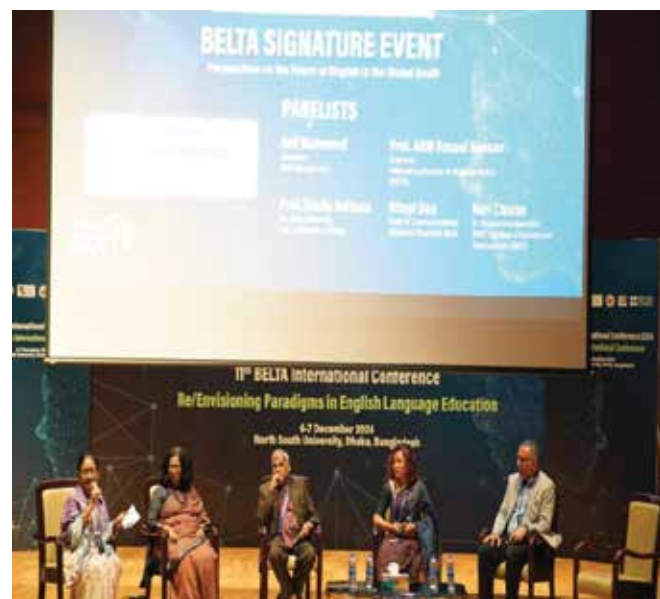
Speakers at the BELTA Signature Event