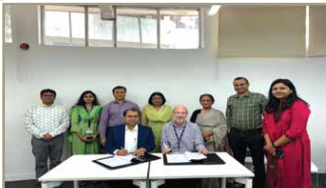
International Participants after signing the agreement