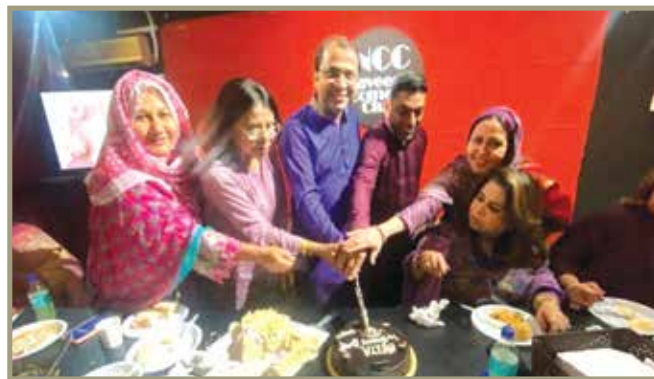
Cutting a Cake